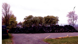
Tire recycle day at Wheeler Township

mosquitoes a place to stay. We probably will not do this every year but maybe every 2 years. Notices will always be in the papers prior to the event.